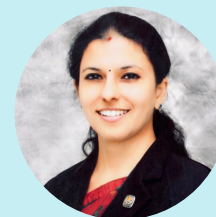
David Sackett Oration by